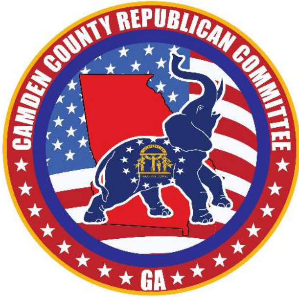
Camden County Ga. Republican Party

“urgent” letter to the Camden County superintendent.